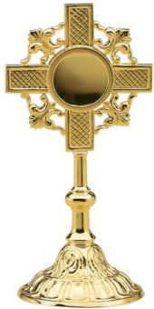
Reliquary made with brass maltese cross with fleur de lys €241.82